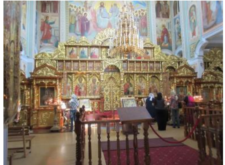
St. Nicolas Cathedral Almaty