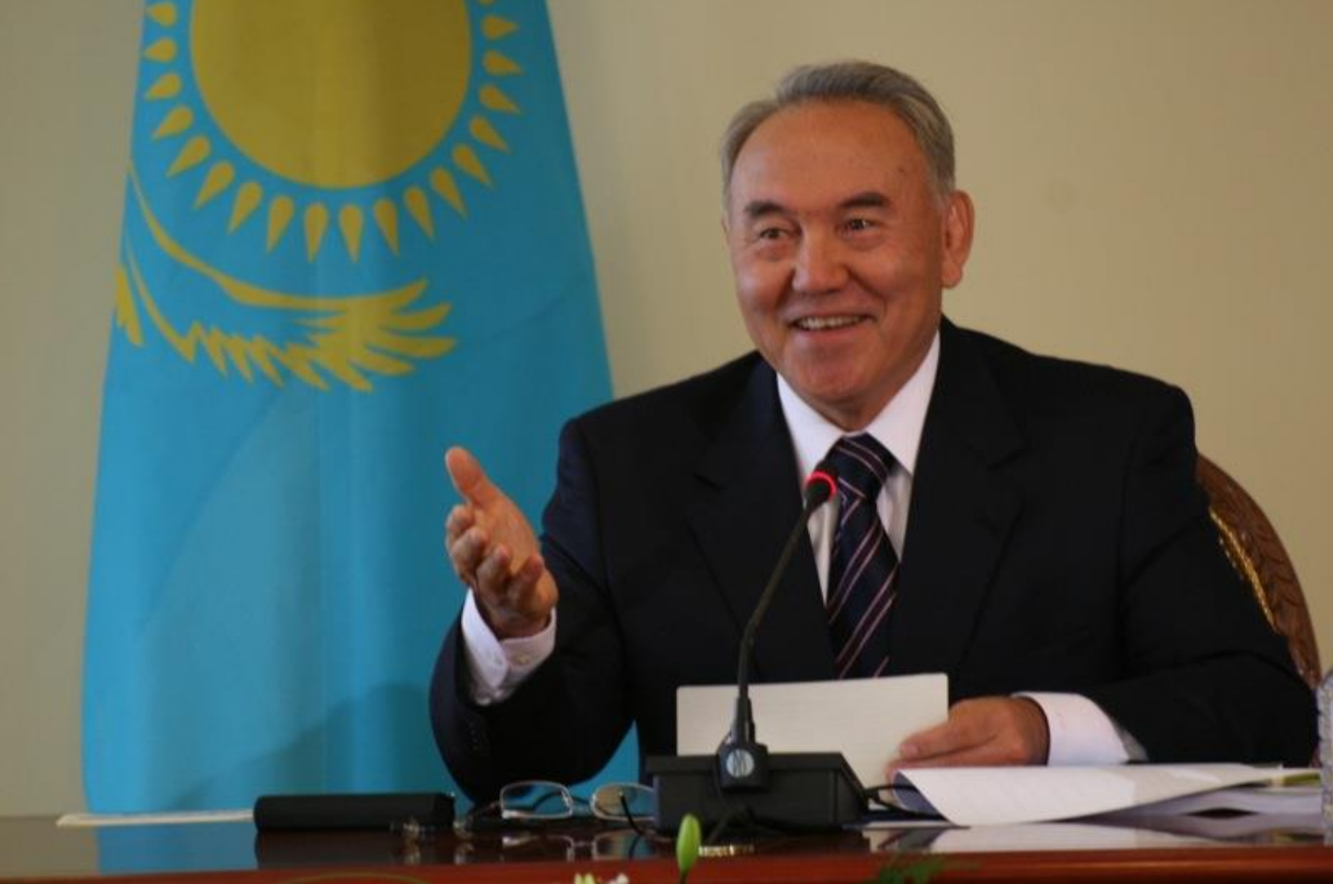
President Nursultan Nazarbayev