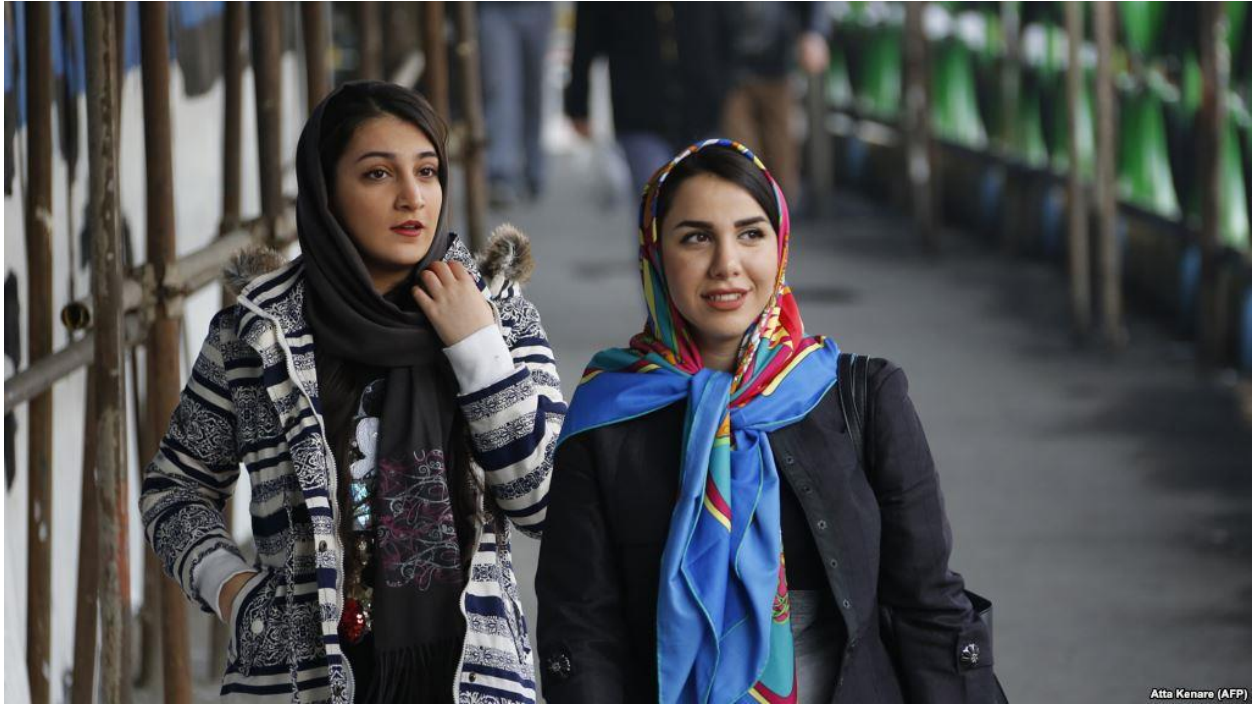
From the article "Iranian Woman Gets Two Years in Prison for Removing Head Scarf." Radio Free Europe, Radio Liberty. 7 March 2018. Web. 23 Oct. 2018.