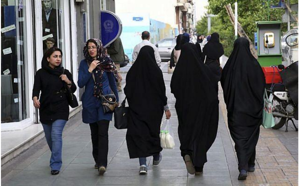
Tehran, Iran, Tuesday, April 26, 2016. frin