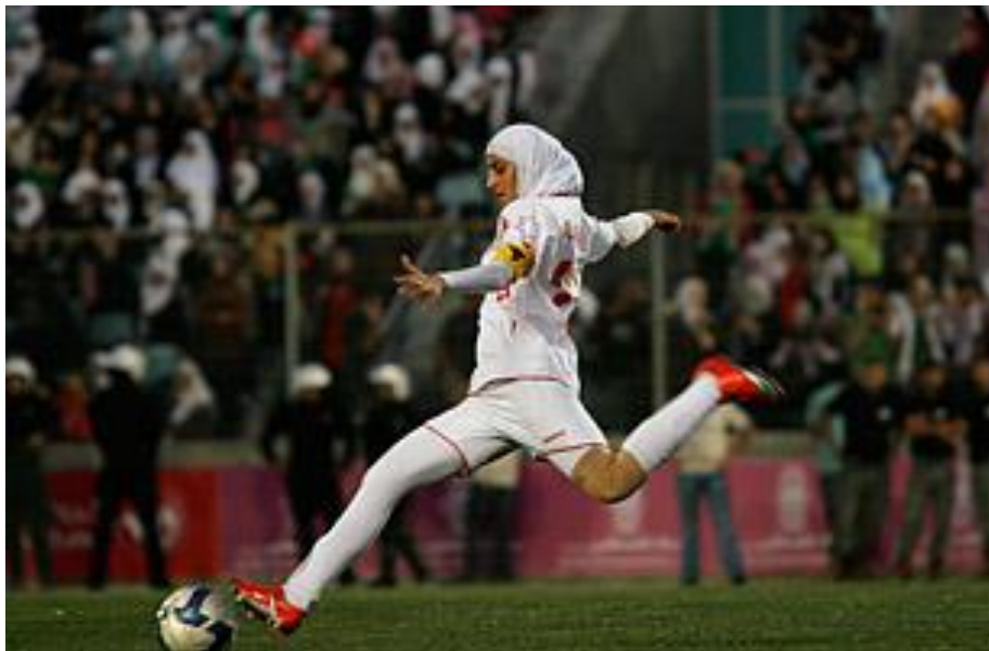
A Warrick Page/Getty Image from: Skarda, Erin. "Iran's Women's Soccer Team's Modest Uniforms." Time . 1 Sept. 2011. Web. 28 Oct. 2018.