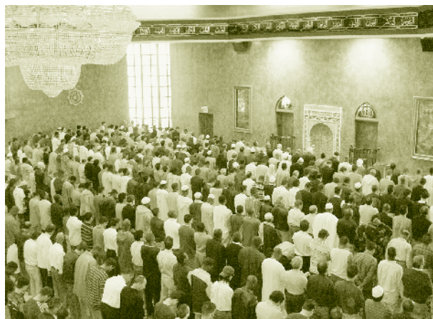
Worshippers at the Islamic Center of Greater Cincinnati.

“Muslim” is the correct term for a person who believes in Islam as a religion. It is another Arabic form of the same root as “Islam.” Its grammatical form is like a participle which means “one who has achieved peace through submission to God.” In reality, however, no person can say they have fully achieved this state of being in this life, except the prophets. One can call oneself a Muslim, but to be Muslim means to live as a person striving to achieve a state of peace with God. For this reason, being Muslim is not a fixed identity but a process. Every Muslim hopes that their striving, their attempt, is accepted by God at their life’s end but knows that this judgment rests with God alone. By the same token, anyone who speaks the shahada (or Islamic creed) must be accepted by others as a Muslim, and there is no excommunication of anyone who has professed the faith. It is fair and proper, however, to critique another Muslim’s behavior as falling short of Islamic standards, but one may not impugn another’s faith itself.