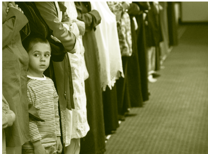
Women praying in the women’s section of the mosque at the Islamic Society of Akron and Kent. Younger children usually attend prayers with their mothers.

A mosque is an Islamic house of prayer. The word mosque is actually a corruption of the original Arabic word masjid by way of the Spanish word mesquita . The name refers to the act of sajda , or sujud , which is the