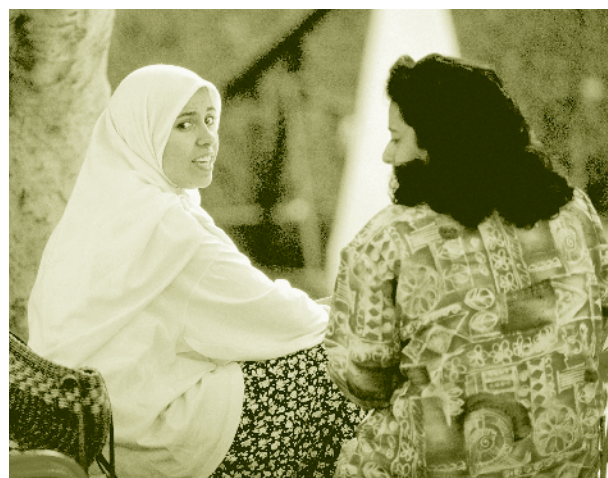
Muslim women in Cairo.

Of the many current misperceptions about Islam, perhaps the most widespread is that women in Islamic law and Muslim society are oppressed and lack rights. To the contrary, the Qur’an specifically grants women a highly significant set of rights. The first of these is spiritual equality, meaning that the woman is viewed as having a soul that is obligated to worship and carry out the rites of Islam in daily life, including attend-