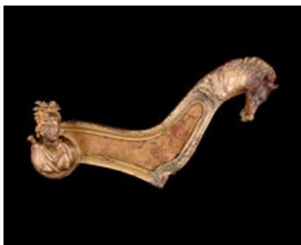
Fragment of a Funerary Bed Qaryat al-Faw, Saudi Arabia Early 1st century CE Gilt bronze H x W: 29 x 3 cm Department of Archaeology Museum, King Saud University, Riyadh