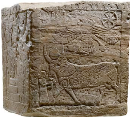
Pedestal or Altar 5th-4th century BCE

The so-called al-Hamra cube was discovered in the al-Hamra Temple at Tayma, an important trading city in northwestern Arabia. Its fine decoration confirms the integration of Egyptian and Mesopotamian motifs into local religious practices, such as the worship of the local god Salm. The bull with a solar disk between its horns relates to the Egyptian bull deity Apis, while the winged disk was inspired by Mesopotamian and Iranian examples. Tayma, Saudi Arabia Sandstone H x W x D: 41 x 38 x 39 cm