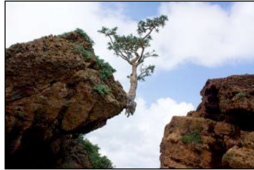
A frankincense tree