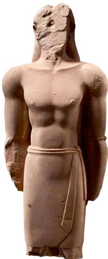
Statue of a Man 4th-3rd century BCE Standing tall and erect, this impressive, larger than life-size statue is one of several examples found in the Lihyanite temple of Dedan in northwestern Arabia. The formal pose and well-defined musculature recall Egyptian and Syrian models that have been interpreted according to the local Lihyanite tradition. An inscription on another statue helps identify them as kings of the Lihyanite dynasty.