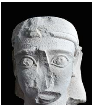
Head of a Statue Tayma, Saudi Arabia 4th–2nd century BCE Sandstone H (approx): 50 cm Tayma Museum

The so-called al-Hamra cube was discovered in the al-Hamra Temple at Tayma, an important trading city in northwestern Arabia. Its fine decoration confirms the integration of Egyptian and Mesopotamian motifs into local religious practices, such as the worship of the local god Salm. The bull with a solar disk between its horns relates to the Egyptian bull deity Apis, while the winged disk was inspired by Mesopotamian and Iranian examples. Tayma, Saudi Arabia Sandstone H x W x D: 41 x 38 x 39 cm