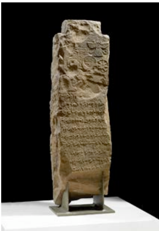
Al-Hamra Stele Tayma, Saudi Arabia ca. 4th century BCE Sandstone H x W: 102 x 45 cm National Museum, Riyadh National Museum, Riyadh